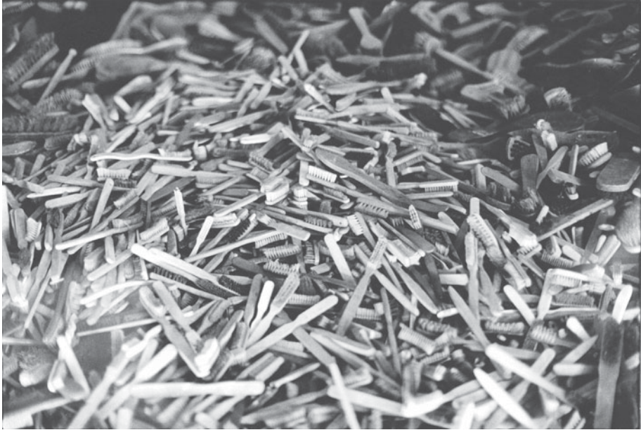
13. Auschwitz: toothbrushes