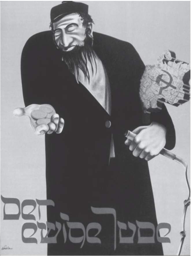
11. 'The Eternal Jew', Nazi poster (1937). Jewish world conspiracy: 'The Jew' has money in one hand, a whip (power) in the other, and the Soviet Union in his pocket.